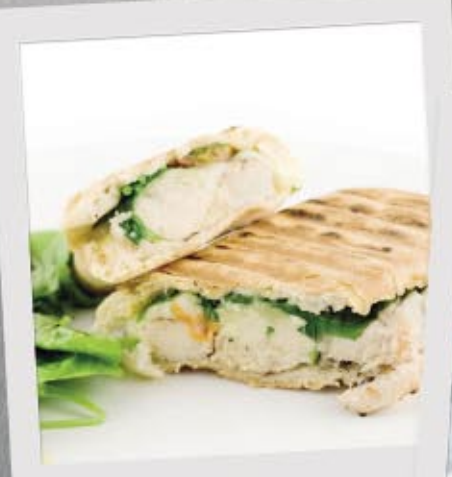
Menu Development Project No., 147