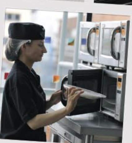
iWave foodservice system in operation